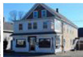
1454 Broadway Haverhill