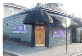
119 Cedar St. Haverhill