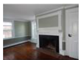
137 Water St, Newburyport, MA - Fireplace